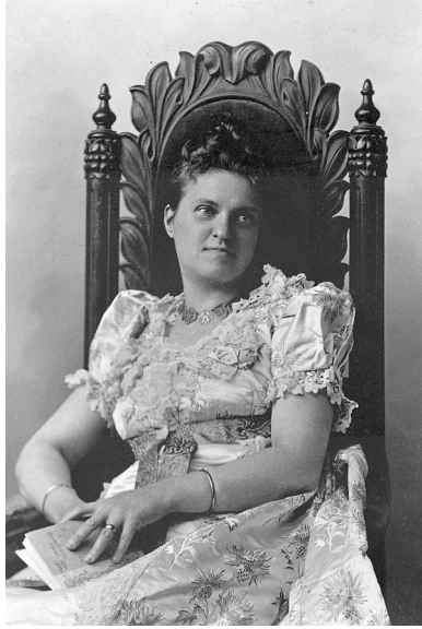
Anne Katherine Green

Anna Katharine Green was born in Brooklyn, New York on November 11, 1846. She had an early ambition to write romantic verse, and she corresponded with Ralph Waldo Emerson. When her poetry failed to gain recognition, she produced her first and best known novel, »The Leavenworth Case: A Lawyer's Story« (1878), praised by Wilkie Collins, and the hit of the year. She became a bestselling author, eventually publishing about 40 books.