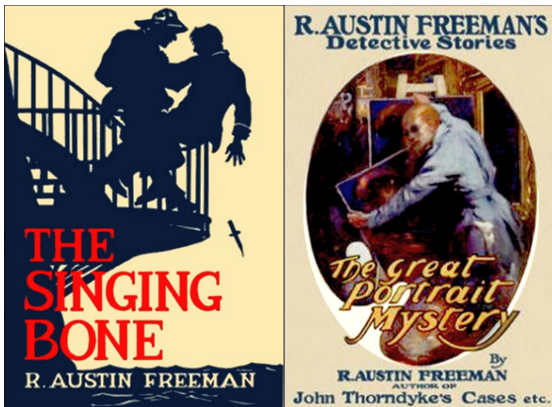
Links das Cover der amerikanischen Erstausgabe von THE SINGING BONE von 1923, rechts das der englischen Erstausgabe von THE GREAT PORTRAIT MYSTERY von 1918.