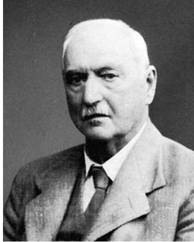
Richard Austin Freeman