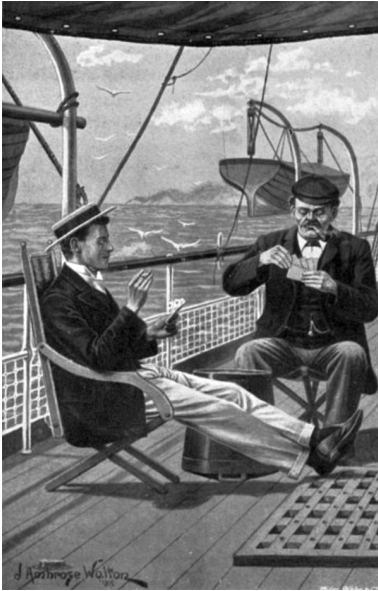
They made a contrast.

together. They made a contrast as they paced up and down on deck, or played cards in the evening; the Englishman being slight and almost fragile in build, the German of the bulldog order, with a manner at once curt and overbearing. I took a dislike to Wickham, and wondered what Cressley could see in him.