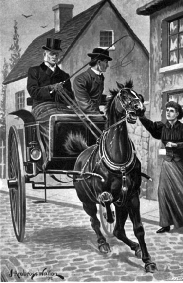
He pulled the mare nearly up on her haunches.

She was a pretty girl with dark eyes, and under ordinary circumstances must have had the vivacious expression of face and the brilliant complexion which so many of her countrywomen possess. But now her eyes were swollen with weeping and her complexion more or less disfigured by the agony she had gone through. She looked piteously at Bainbridge, her lips trembling. The next moment she burst into tears.